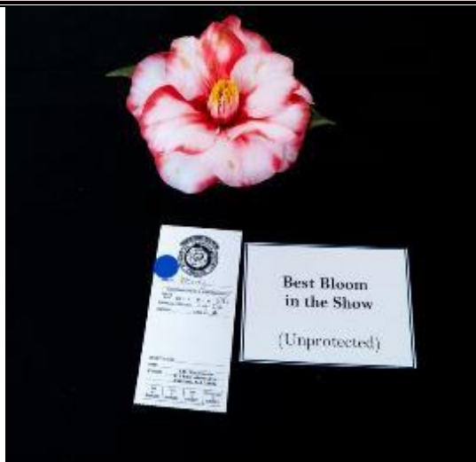
Best Bloom in Show, Unprotected J.D. Thomerson