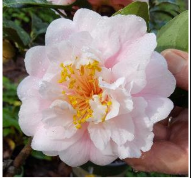
CM Wilson, variegated