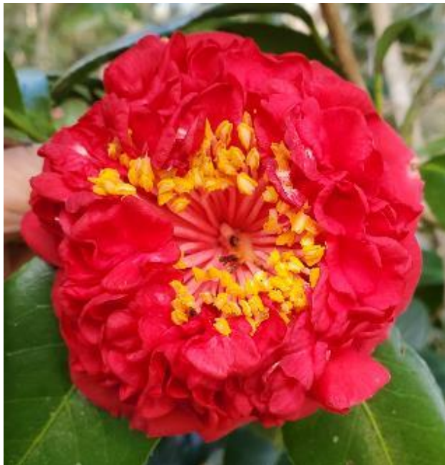
Blaze of Glory