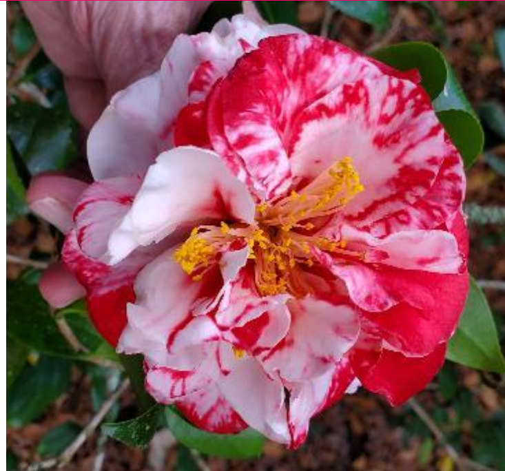
Dixie Knight Supreme