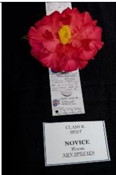
Best Bloom, Novice category Phil Leilich