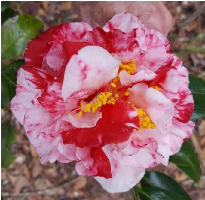
Dixie Knight Supreme