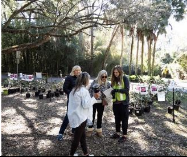
Customers being assisted at the Plant Sale.