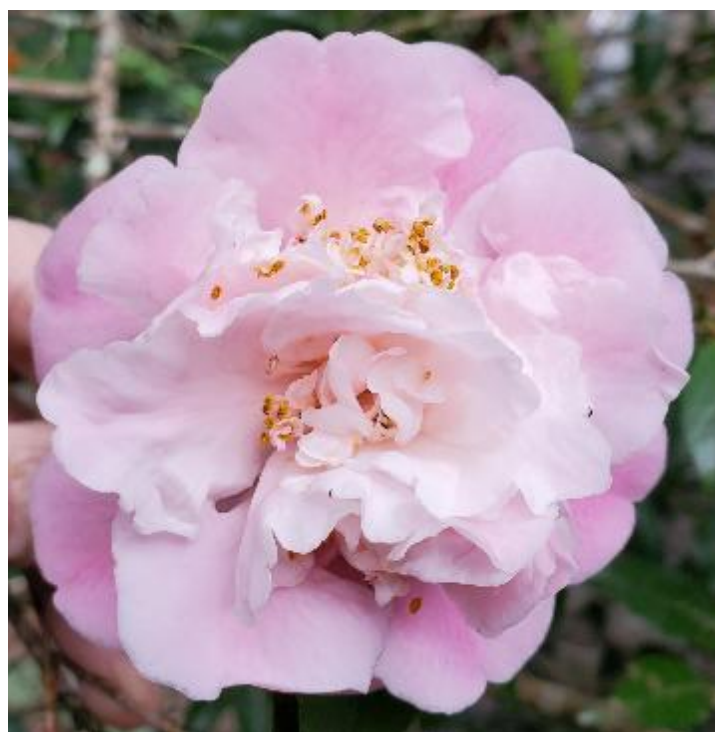
Sweet Emily Kate