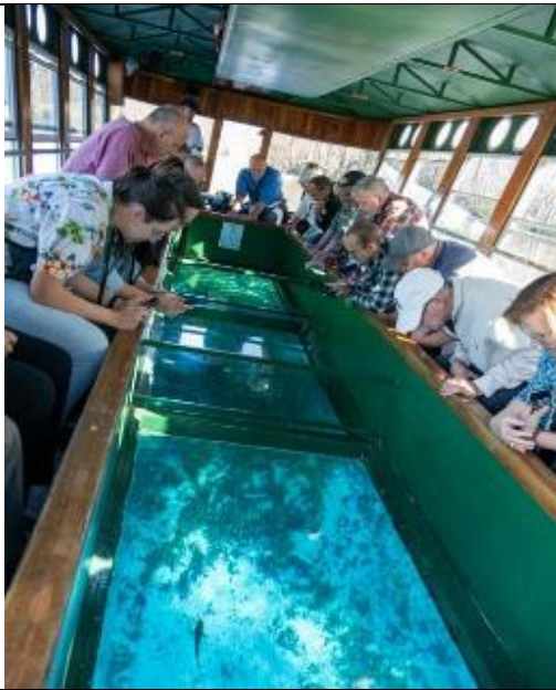
Silver Springs excursion, ACS Convention.